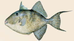
Triggerfish (Gray) ▲●X